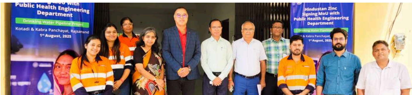
Hindustan Zinc takes pride in this meaningful collaboration with PHED

We, in collaboration with Public Health Engineering Department (PHED) Udaipur, signs an MoU to provide clean drinking water to over 10,000 people across 11 villages in the Railmagra region of Rajasthan. As part of the ₹19.7 crore project, we will contribute ₹4.7 crore under our community initiative to support pipeline-based water supply, overhead tanks, and storage infrastructure. This initiative addresses long-standing water challenges in villages around the Rajsamand district like Kotdi, Kabra, and Khadbamaniya, reinforcing our commitment to community well-being.