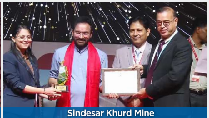
Sindesar Khurd Mine