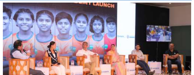
Our guests sharing their collective vision for advancing grassroots football