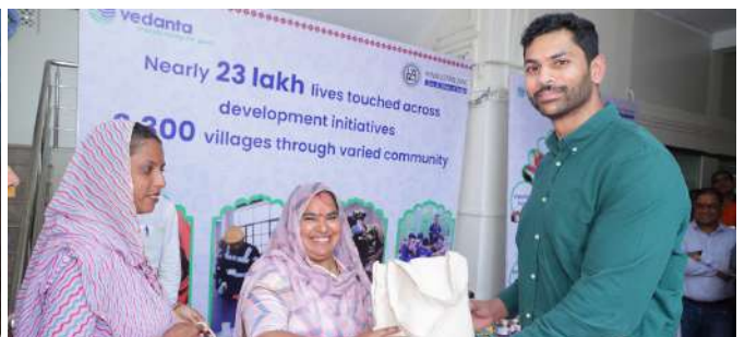
Sakhi Didis showcased handcrafted fashion and savoury products from our homegrown brands Upaya and Daichi