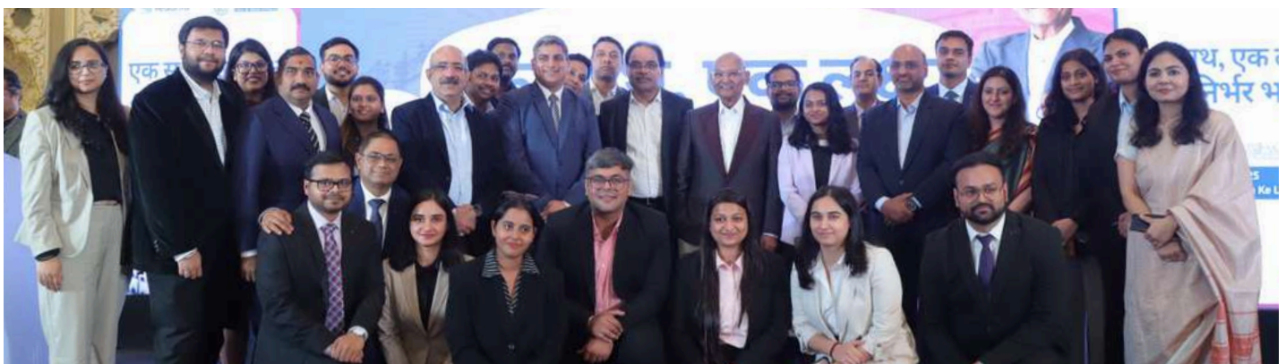
With the Hindustan Zinc team

He interacted with young talent, encouraging them to take on diverse roles and think beyond boundaries. Emphasising the growing importance of integrating Artificial Intelligence and emerging technologies across functions, he urged them to lead innovation. By sharing personal anecdotes, he further motivated and inspired the next generation of leaders.