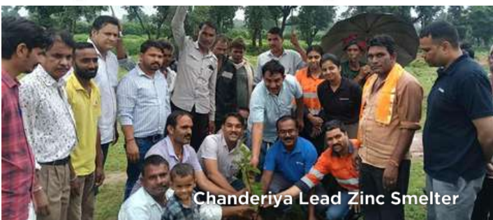
Chanderiya Lead Zinc Smelter