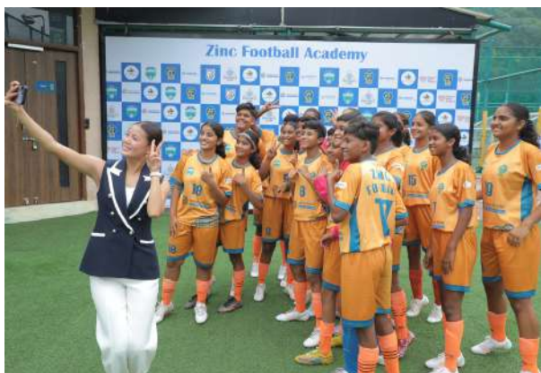
Sweeti Devi, Captain - Indian Women's Football Team with the girls of the Academy

Zinc Football is a one-of-its-kind grassroots initiative by Hindustan Zinc, anchored around a state-of-the-art residential girls' academy and powered by India's first tech-enabled training system, the F-Cube. While setting new benchmarks in coaching and performance, the initiative goes beyond the pitch and leverages the power of football to drive lasting social impact, empowering not just the girls, but also the communities they represent.