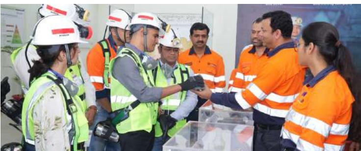
Amara Raja team exploring the product gallery and understanding our ore-to-metal journey