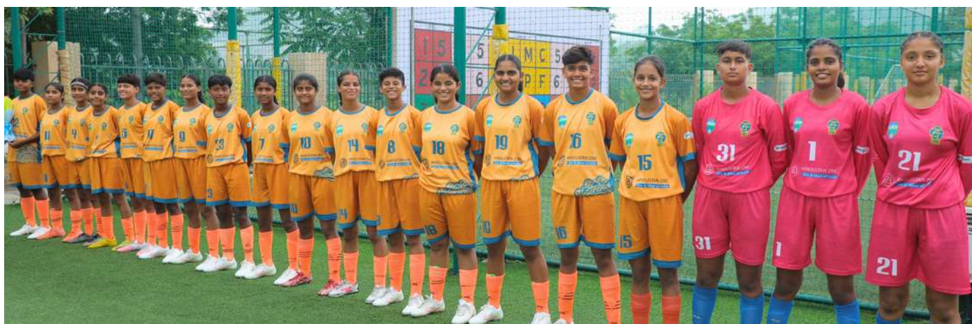
Zinc Football Girls Academy - Class of 2025