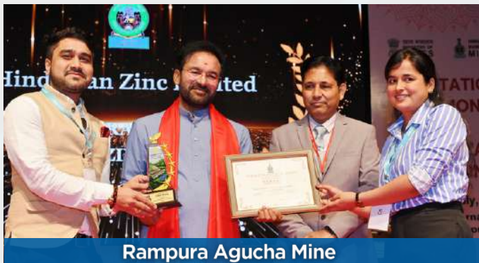
Rampura Agucha Mine