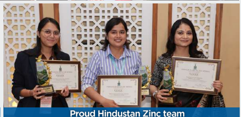
Proud Hindustan Zinc team