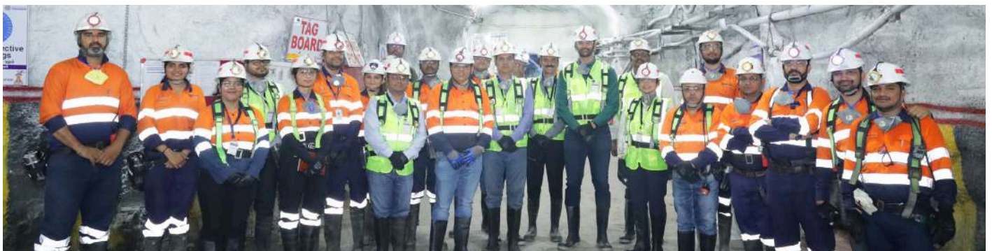
Welcoming Amara Raja Energy & Mobility to the world's most technological mine at Sindesar Khurd, Rajasthan

We welcomed our esteemed long-term partner, Amara Raja Energy & Mobility, for a strategic visit aimed at deepening our collaboration in the realm of clean energy transition. Over the years, our partnership has grown through the supply of lead, a critical metal for energy storage solutions. Today, we are exploring new avenues in innovative battery technologies.