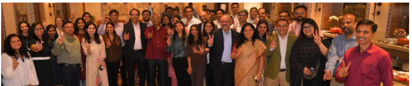
Engaging with our senior leadership team and young talent

He interacted with young talent, encouraging them to take on diverse roles and think beyond boundaries. Emphasising the growing importance of integrating Artificial Intelligence and emerging technologies across functions, he urged them to lead innovation. By sharing personal anecdotes, he further motivated and inspired the next generation of leaders.