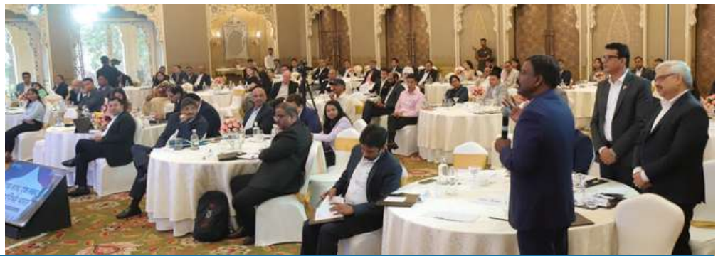
Open discussion with our stakeholders on new ideas, suggestions and collaboration

He emphasised working shoulder to shoulder with our business partners and customers, assuring them of Vedanta's continued support. Highlighting India's rise as a land of entrepreneurs, he stressed the need for strong leadership and encouraged women to take on diverse roles.