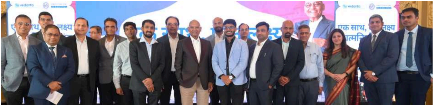
Partnering for shared growth and success

Reinforcing the idea that 'You and I are one,' he stressed collective commitment to success. He invited suggestions to enhance safety, productivity, innovation, and digitalisation, urging all to take ownership, stay driven, and embrace challenges.