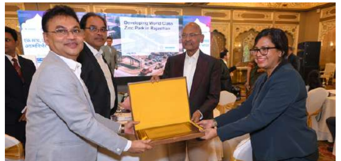
Cheerful moments with our business partners