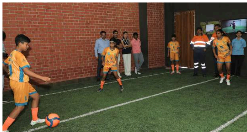
Demonstrating the F-Cube Technology