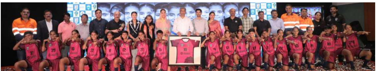
Launching the Zinc Football Girls Academy

In a significant step towards fostering equality, empowerment, and sporting excellence, Hindustan Zinc today launched the Zinc Football Girls Academy in Zawar, near Udaipur, Rajasthan. As part of its community development efforts, the academy will nurture talented girls from rural and under-represented areas. The first batch of 20 girls, selected through a national scouting process, will receive football training, education, and holistic support to grow into confident athletes. Backed by the All India Football Federation (AIFF), the academy aims to shape the future of women's football in India.