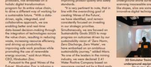
3D Simulator Training for underground mining at Hindustan Zinc

Hindustan Zinc has aimed towards excellence for decades by developing the mines using best-in-class technology and implementing smart, safe, and sustainable operations across its sites. The company has established numerous production and MSD facilities, including onshore and offshore processing plants. One of the world's largest Zinc-Lead-Silver producers, Hindustan Zinc, has embarked on a holistic digital transformation program for its entire value chain, to drive a different way of working for a sustainable future. "With a data-driven, agile, integrated, and collaborative approach, we are enabling better and real-time data-based decision-making through the integration of technologies across the value chain, resulting in reducing waste, increasing resource efficiency, and doing up productivity, improving safe work practices while promoting the use of renewable energy sources," said Arun Misra, CEO, Hindustan Zinc.