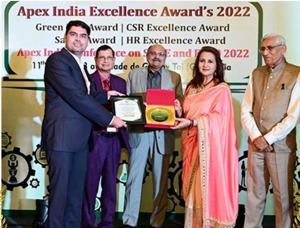
Zawar Group of Mines Wins Platinum Award at Apex India Green Leaf Awards 2022