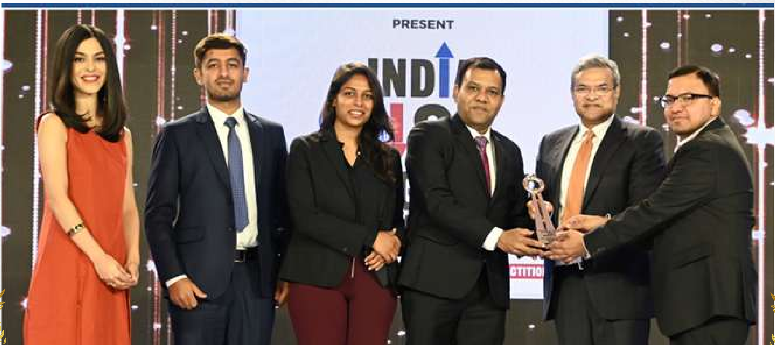
Double sweep for Hindustan Zinc, wins 'Masters of Risk Jury Award in Metals & Mining and ESG Specialization' at India Risk Management Awards

In our pursuit of excellence in all domains, we're pleased to share that Hindustan Zinc's Business Continuity Management Systems has been certified ISO 22301:2019 for complying with the guidelines of international standard across mines, smelters, power plants and offices.