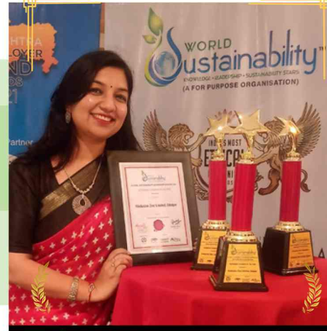
HINDUSTAN ZINC WINS 3 AWARDS AT THE GLOBAL SUSTAINABILITY LEADERSHIP AWARDS