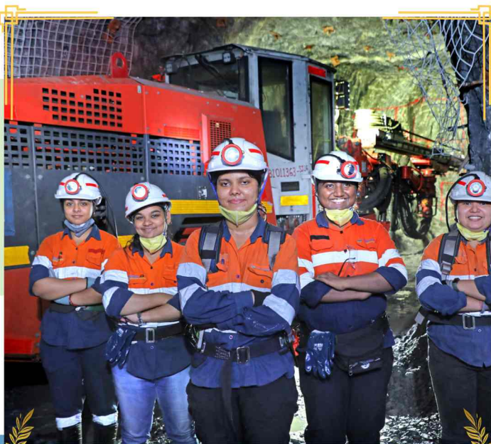
HINDUSTAN ZINC BAGS TWO AWARDS AT SHRM HR EXCELLENCE AWARDS IN DIVERSITY & INCLUSION, AND LEVERAGING TECHNOLOGY