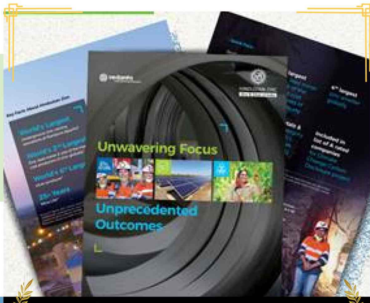
HINDUSTAN ZINC'S INTEGRATED ANNUAL REPORT FY20-21 WINS GOLD AT LEAGUE OF AMERICAN COMMUNICATIONS PROFESSIONALS