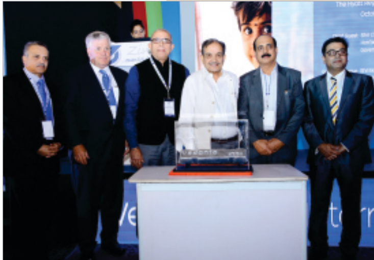
■ International Galvanizing Conference 2016 Focuses on New Market Development