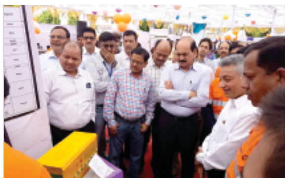
■ 'Aarohan' - 3rd Birthday Celebration and Safety Exhibition