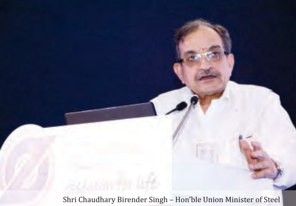
Shri Chaudhary Birender Singh – Hon'ble Union Minister of Steel

International Galvanizing Conference on 20th - 21st October 2016 in Delhi