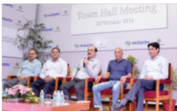
■ Safety Town Hall at HZL