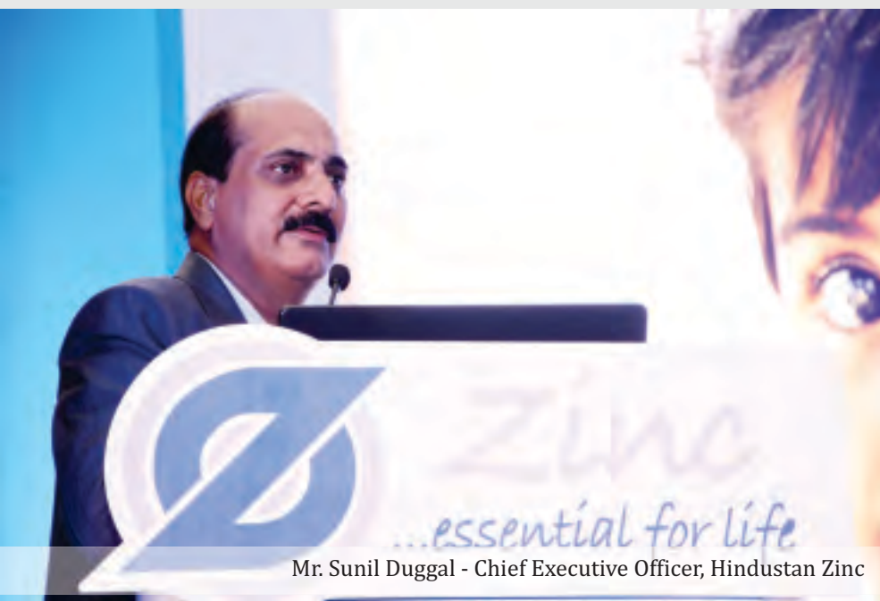
Mr. Sunil Duggal - Chief Executive Officer, Hindustan Zinc

produced, needs to be consumed. Coastal area structures are prone to corrosion incurring loss of over Rs. 1000 crores every year. The structures built on 8000 km coastal line of India needs to be protected by choosing galvanized bar. Hon'ble Prime Minister - Shri Narendra Modi's Smart City Project will be built on reformed structures that will promote usage of Steel and Zinc. We need to focus on Research & Development and Exploration.”