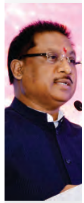
Mr. Vishnu Deo Sai Hon'ble Minister of State for Steel & Mines

On the occasion, CEO, HZL also said "The launch of 'HZDA' is in line with the support of Prime Minister's flagship program 'Make in India' and is expected to replace the imported zinc alloys and to cater to the need of Auto and Steel Industry. Hindustan Zinc is ready to meet 100% die-casting requirement in India."