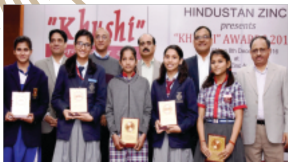
■ Hindustan Zinc Awards 27 Students For Promoting "Khushi"