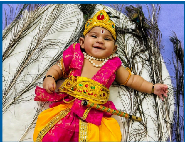
Rajpura Dariba Complex