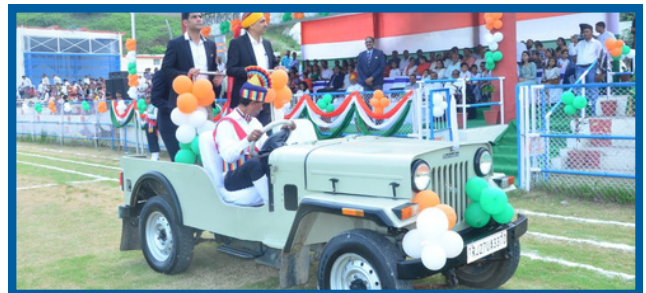
Zawar Group of Mines