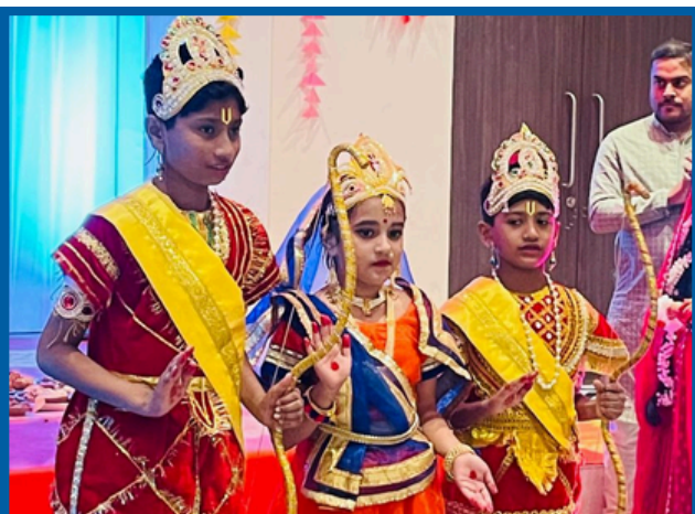
Zawar Group of Mines