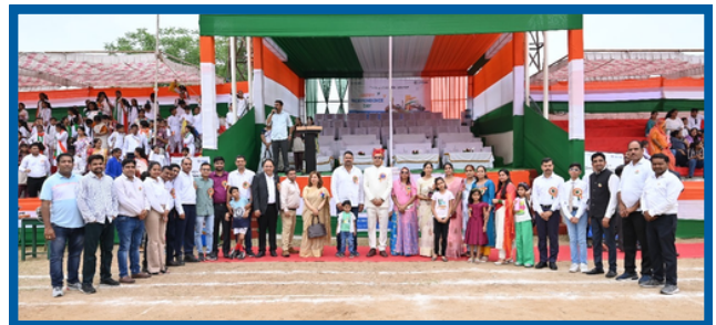
Rajpura Dariba Complex