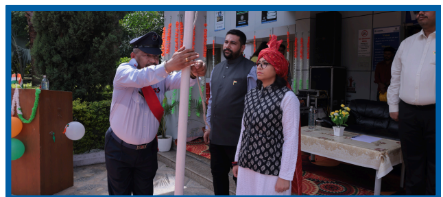
Pantnagar Metal Plant