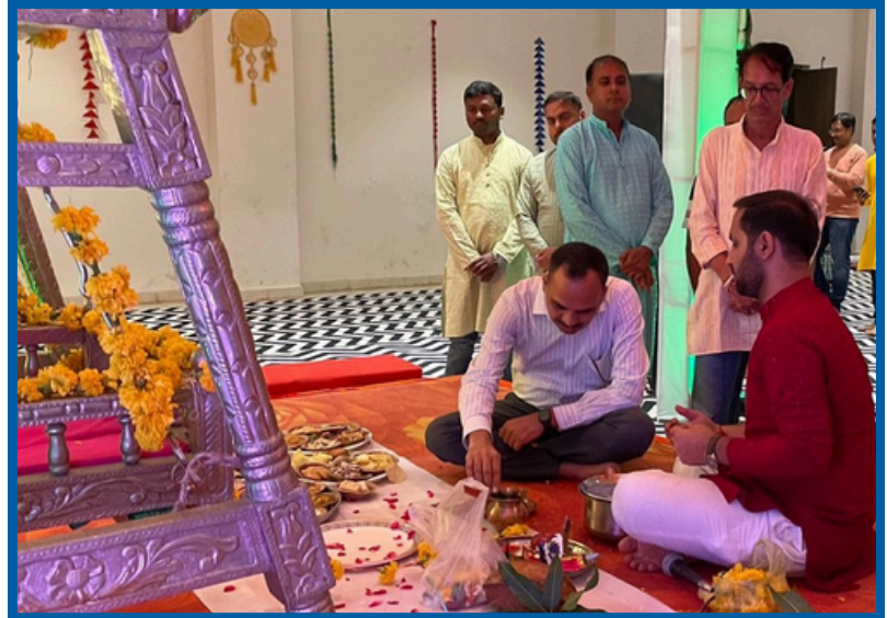
Zawar Group of Mines