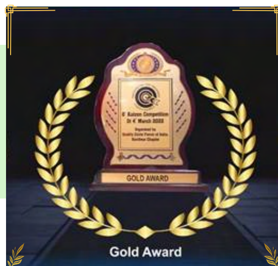
HINDUSTAN ZINC'S PANTNAGAR METAL PLANT WINS 3 AWARDS AT THE 8TH KAIZEN COMPETITION