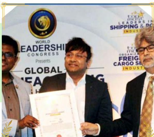
HINDUSTAN ZINC RECOGNIZED AS "TOP MOST MANUFACTURING COMPANIES" BY WORLD MANUFACTURING CONGRESS