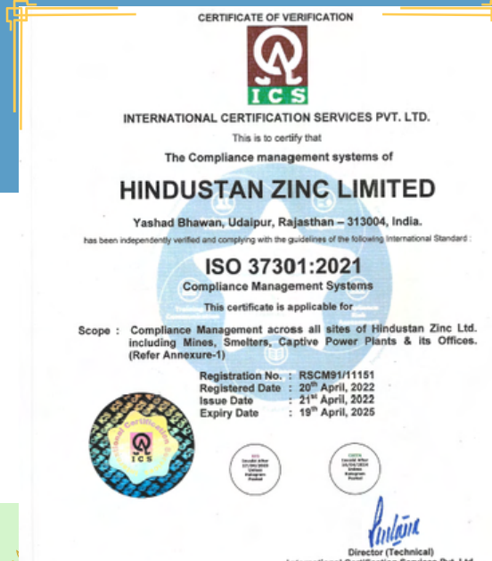
HINDUSTAN ZINC'S COMPLIANCE MANAGEMENT SYSTEM CERTIFIED WITH ISO 37301:2021