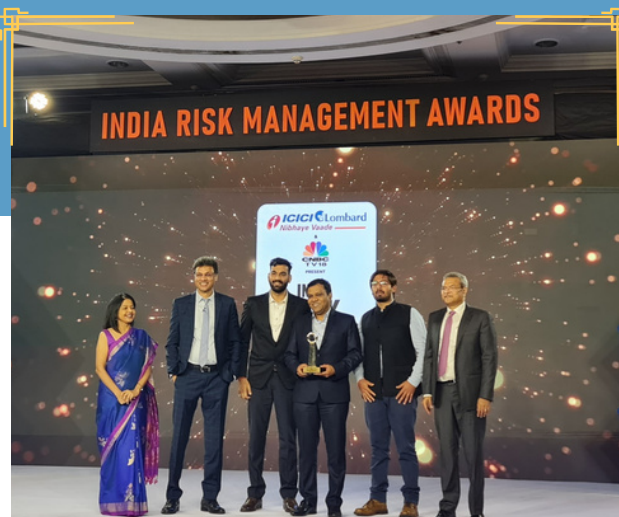
HINDUSTAN ZINC WINS MASTER OF RISK - FRAUD PREVENTION & ETHICS MANAGEMENT AT INDIA RISK MANAGEMENT AWARDS