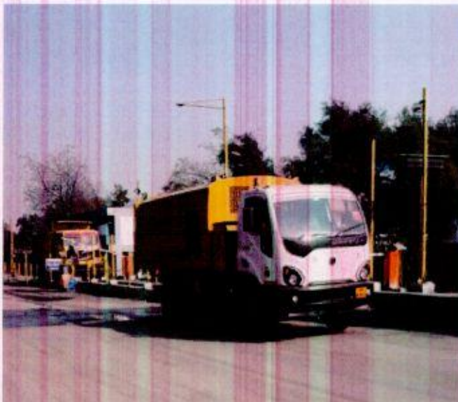
MECHANICAL TRUCK MOUNTED ROAD SWEEPER