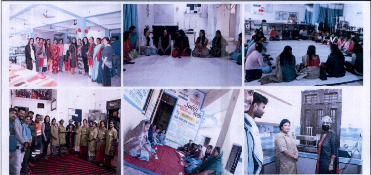
Women Empowerment- Strengthening of Self-Help Group by 33 villages and covered around 3000+ families. This project (Sakhi) was implementing through Manjari Foundation. Started in the year 2017 and continuing.