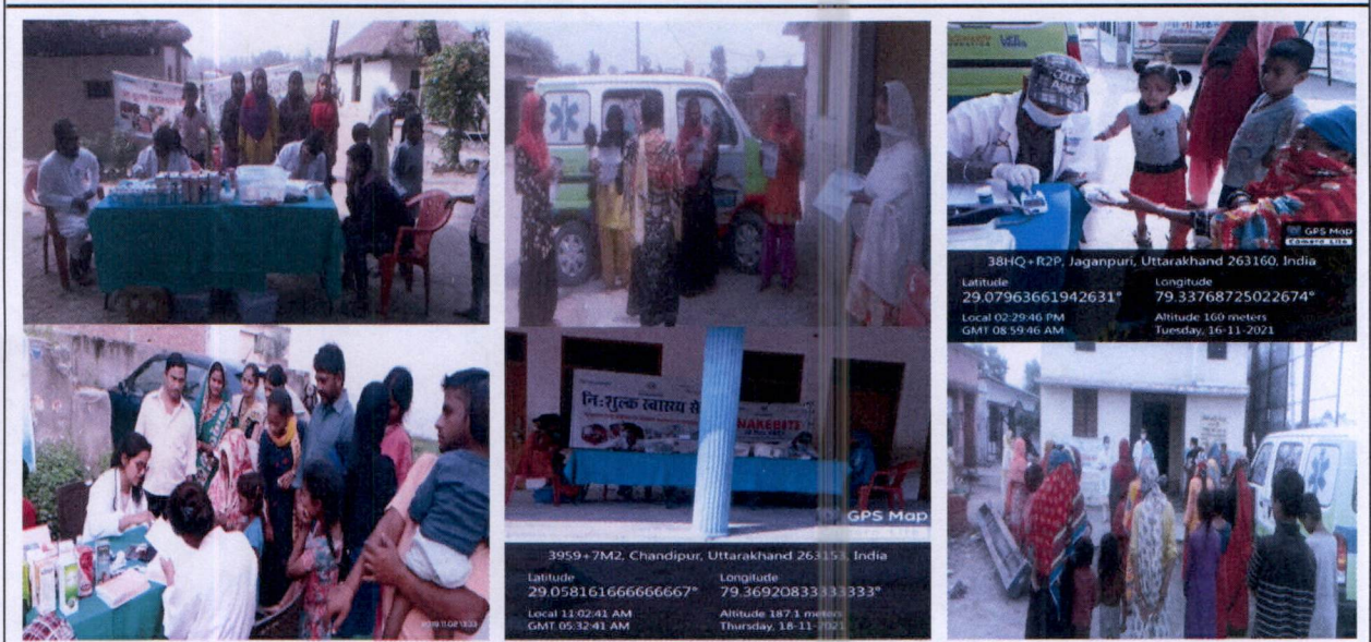
Health, Water & Sanitation- Running mobile health clinic van in 25 villages on daily basis. Providing free doctor consultation, free medicine distribution etc. being done through this project. Daily in one village this camp will be held.