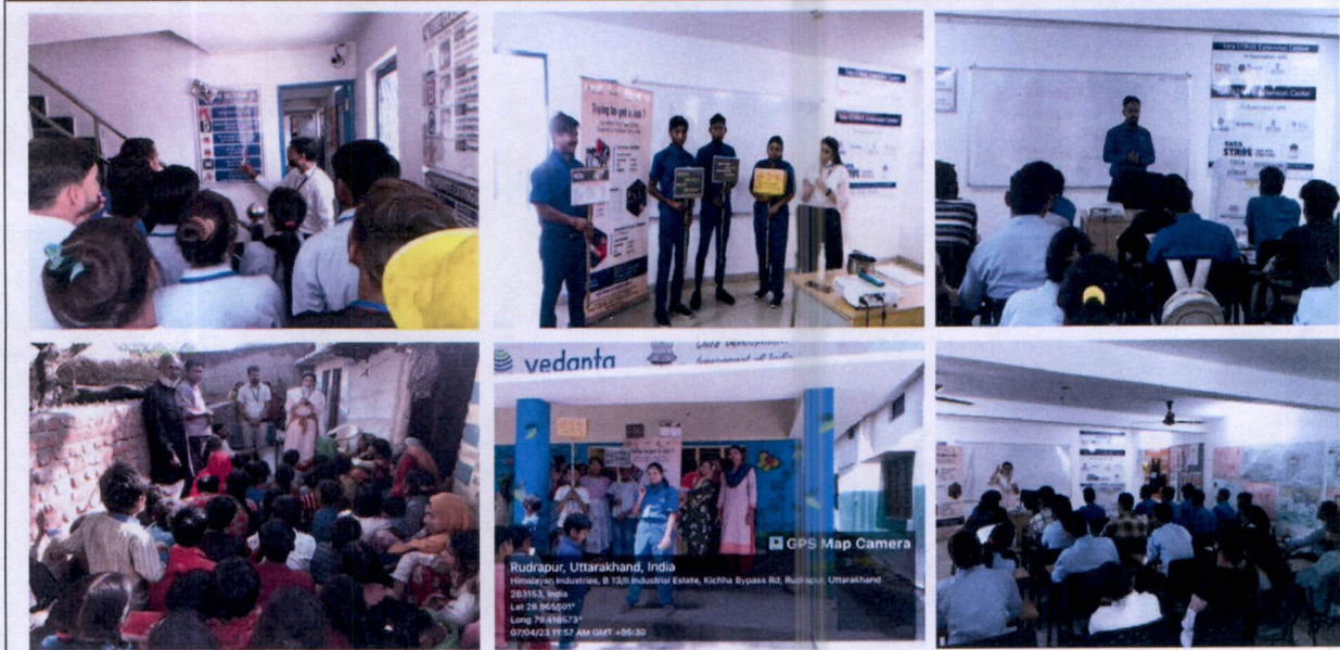
Youth Skill Development Program- Imparting Skill training program with TATA STRIVE in field of Auto Sales, Auto technicians, Automotive Services in two, three & four wheelers for Youth from nearby community.