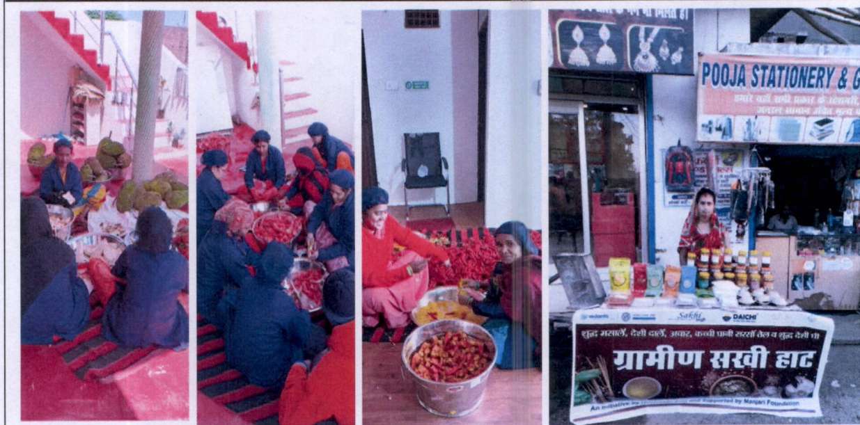
Misc. activities- Formation of pickle unit and Rural Sakhi Haat, Women's day celebration