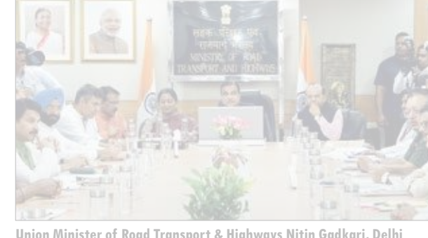
Union Minister of Road Transport & Highways Nitin Gadkari, Delhi Lt. Governor V.K. Saxena and Chief Minister Rekha Gupta review the progress of the ongoing National Highway projects in Delhi

Reacting to the developments, AAP issued a sharp rebuttal, accusing the BJP of orchestrating a smear campaign. "This is not a scam, it's a politiwelfare associations, students, The workshop focused on silence opposition," the party said in a statement.