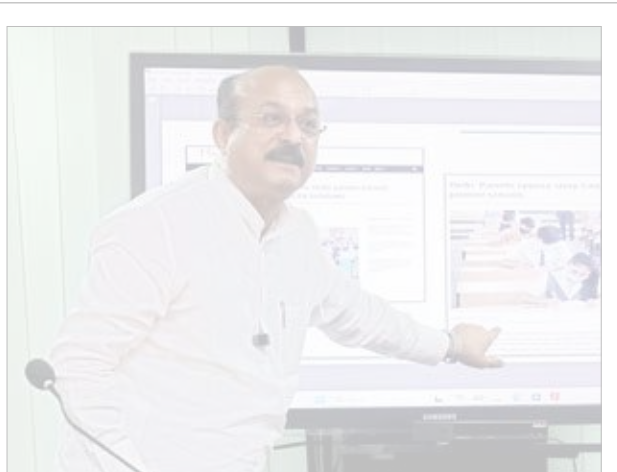
Minister Ashish Sood during a press conference

'sheesh mahal' and now the AAP is blaming our CM Rekha Gupta-led government," he said.