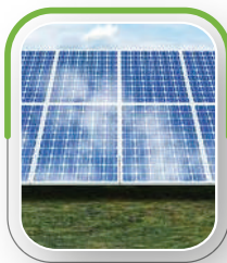
Solar Photovoltaic Cells (PV)