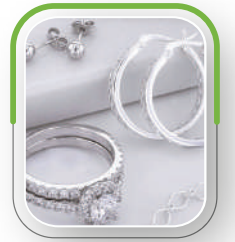
Luxury & Heritage Artifacts