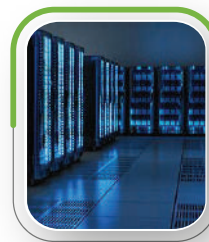
Data Centers & Cloud Computing